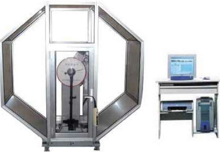
ITC-500 shown with optional safety cover.